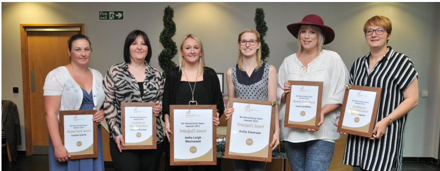
Early Years and Care students receive their awards.

Register your interest now at universitycampus.barnsley.ac.uk